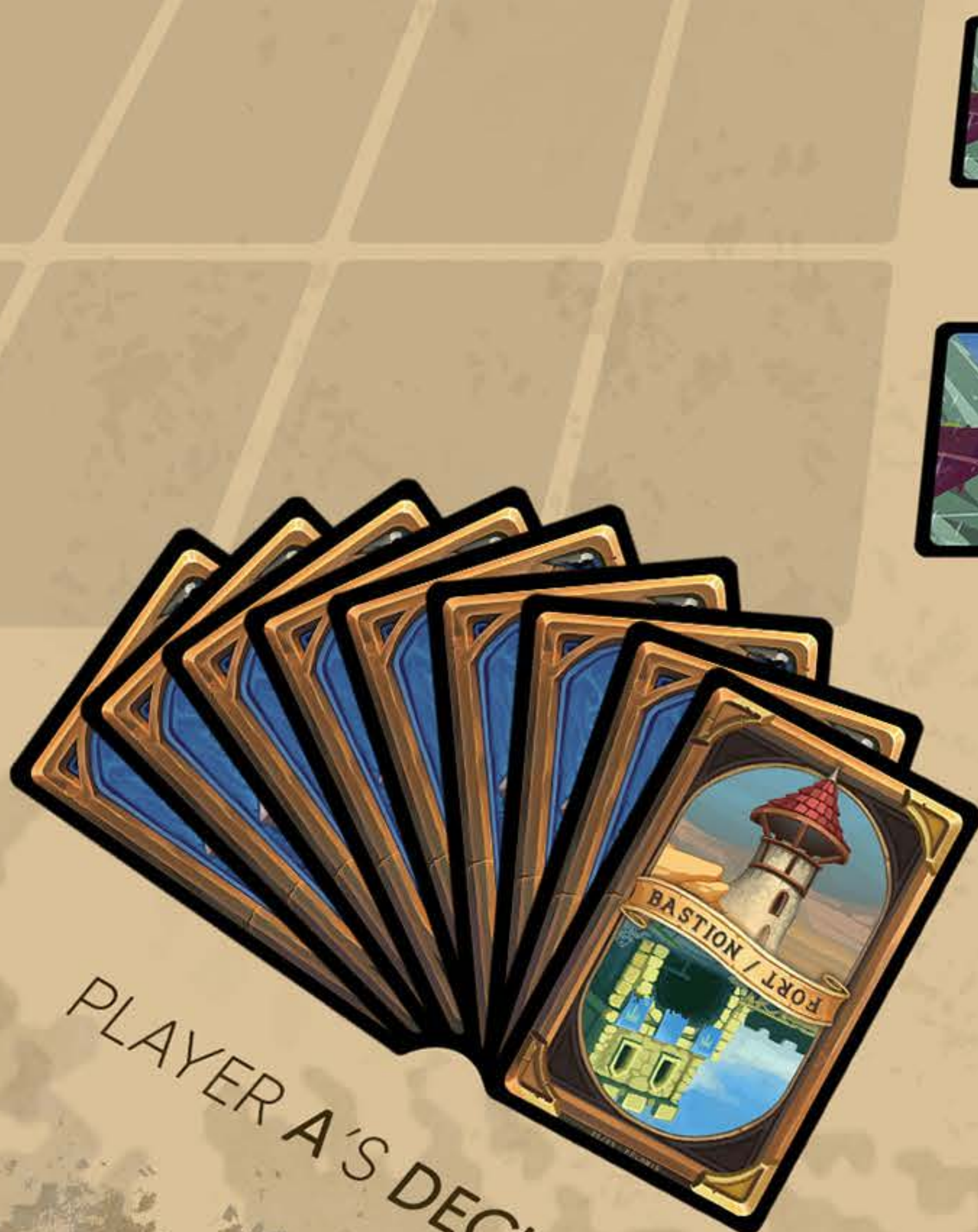
PLAYER A'S DECK