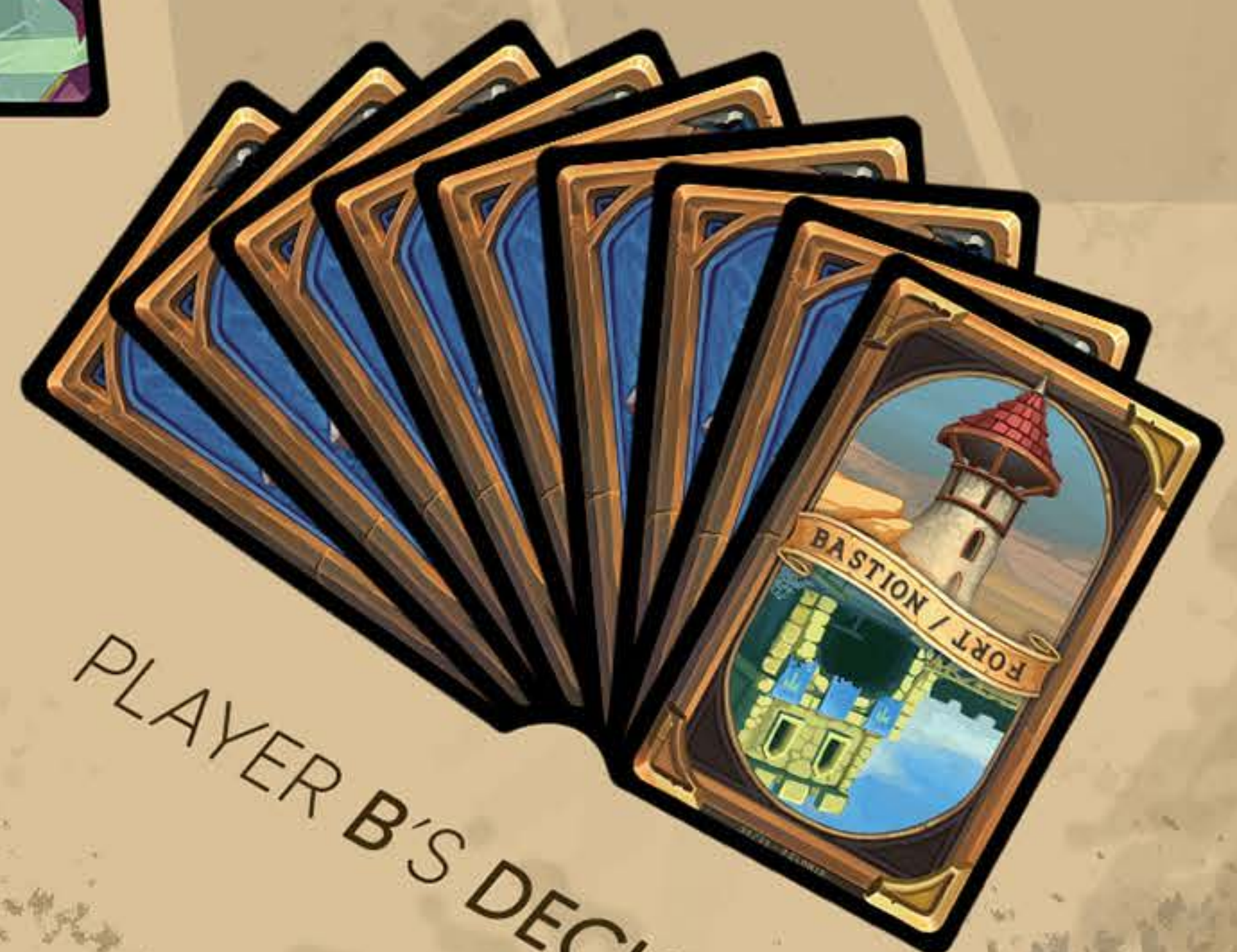
PLAYER B'S DECK