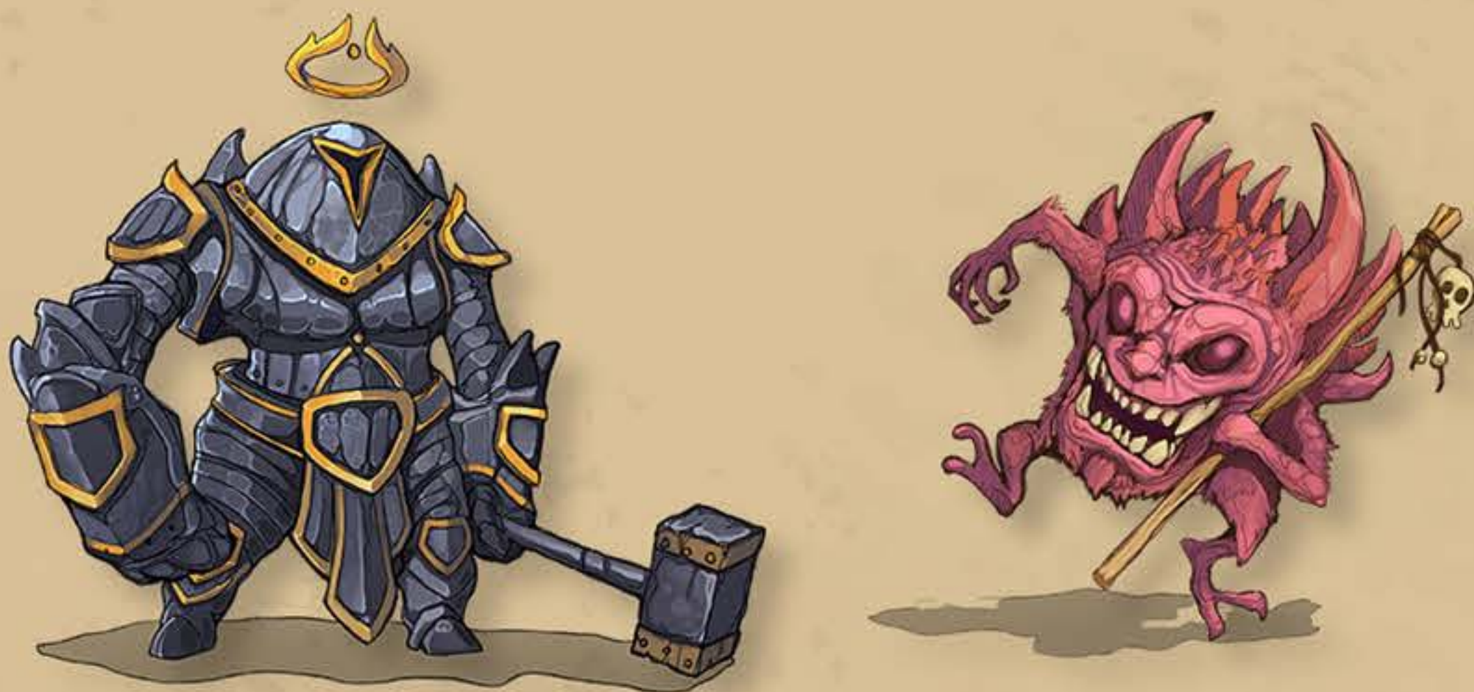
PLAYER A'S KINGDOM

Player A's Kingdom is located on the left of the Bridge cards. Player B's Kingdom is located on the right of the Bridge cards. It is therefore recommended for the players to sit side by side.